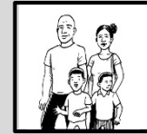
get my family