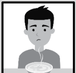
loss of taste and smell