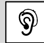
assistive listening devices