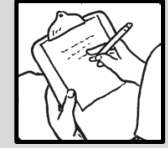
pen and paper