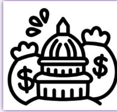
BUDGET SIDE BY SIDE