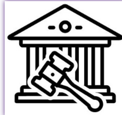
BILLS OF INTEREST

https://arcwa.org/advocacy/bill-tracker/