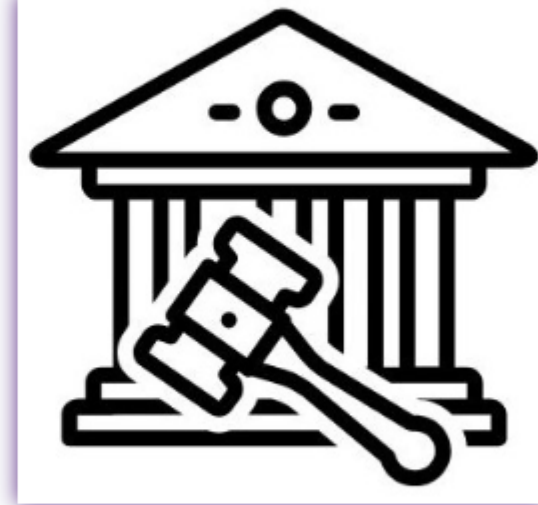
BILLS OF INTEREST

https://arcwa.org/advocacy/bill-tracker/