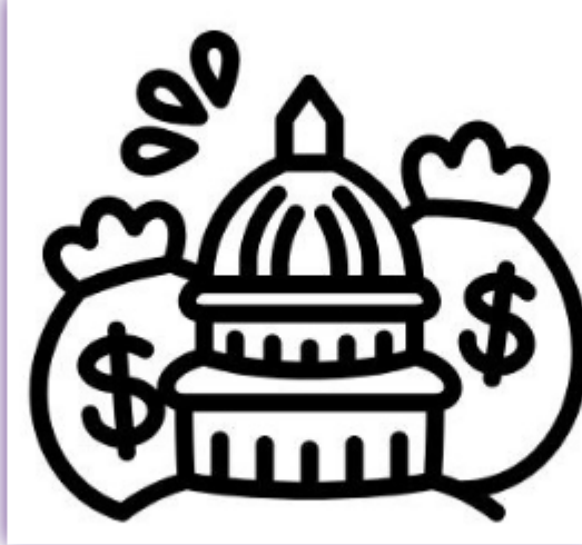
BUDGET SIDE BY SIDE