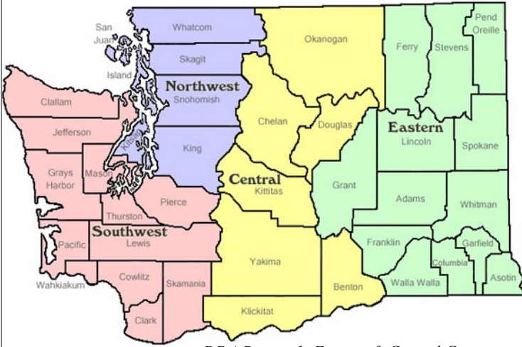
DDA Region 1: Eastern & Central Counties DDA Region 2: Northwest Counties DDA Region 3: Southwest Counties