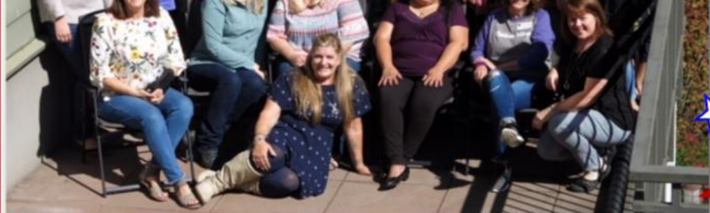
WA State Parent to Parent Coordinators 2018 Training Olympia, WA (front row Veterans with 15+ years)